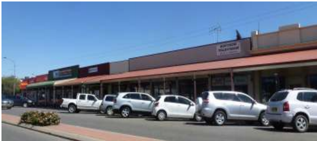
Run of continuous verandahs all erected as part of the verandah program, which now provide amenity and shade for pedestrians and business owners.