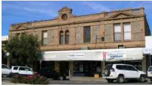
Pirie Building - Existing condition