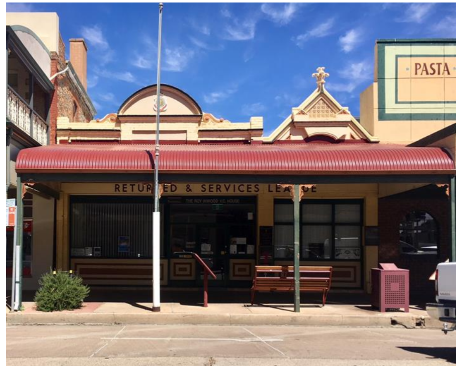
Subject site – 403 Argent Street

The Department further notes on their website "Each Anzac Day and Remembrance Day local communities gather around town memorials to commemorate those who left their community to join other service personnel in the defence of freedom".