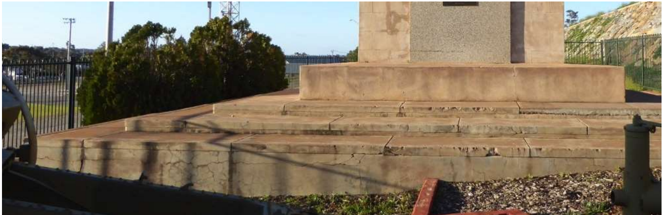
West plinth base – note cracking of paving

Concrete Slabs/ Base steps – the base of the war memorial is cement paving stepped up to the base. This paving is concrete reinforced slabs with rendered risers and the reinforcing bars are now rusted and causing cracking of the surface concrete paving.