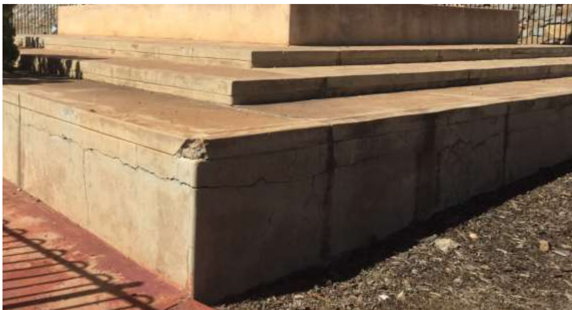
view from north west of plinth showing typical deterioration