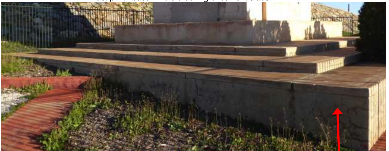
view from north east of plinth showing typical deterioration

Repair fractures (crack inject an acrylic polymer ) and remove drummy cement render to base upstand and replace (where arrowed).